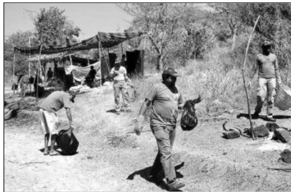
Environment awareness:Volunteers from Kenneth Anderson Nature Society (KANS) collecting waste dumped by the devotees in and around the Basava temple.

KRISHNAGIRI: The Hosur-based Kenneth Anderson Nature Society (KANS) undertook an intensive cleaning drive near Basava temple located on the banks of the River Cauvery at Dabguli in Urigam ranger of Hosur forest division recently.